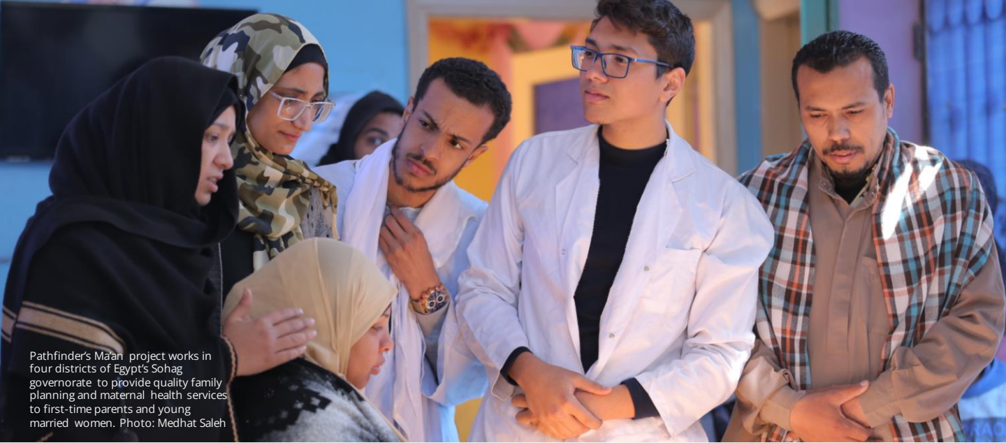
Pathfinder's Maan project works in four districts of Egypt's Sohag governorate to provide quality family planning and maternal health services to first-time parents and young married women.