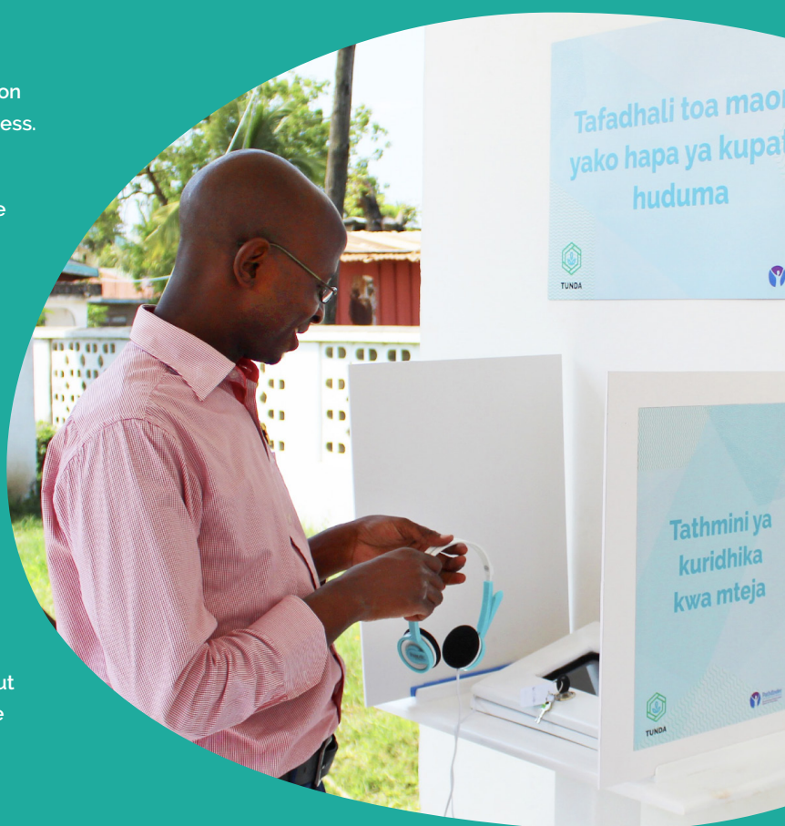
with written consent from participants