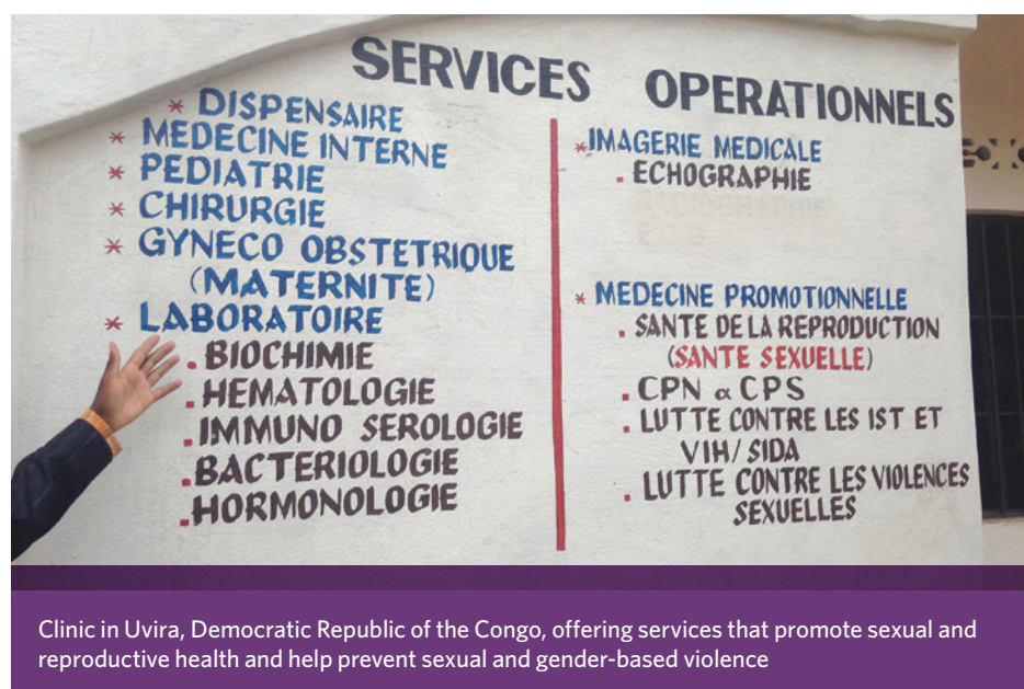
Clinic in Uvira, Democratic Republic of the Congo, offering services that promote sexual and reproductive health and help prevent sexual and gender-based violence

While an incremental or tempered approach was the method to navigate potential backlash that surfaced in interviews with Burkinabe and Tanzanian respondents, respondents from DRC highlighted their strategy of reframing their messaging to mitigate potential backlash.