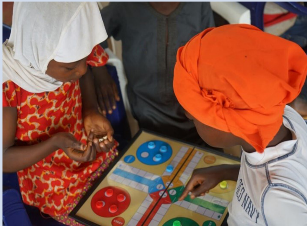
Photo credit: Bayo Ewuola, Pathfinder International, 2022. Empowered Choices peer session in Durumi, an Area 1 IDP camp in Abuja.

Pathfinder International in Nigeria No 35- Justice George Sowemimo Street Asokoro, Abuja, Nigeria +234 9-291-6282