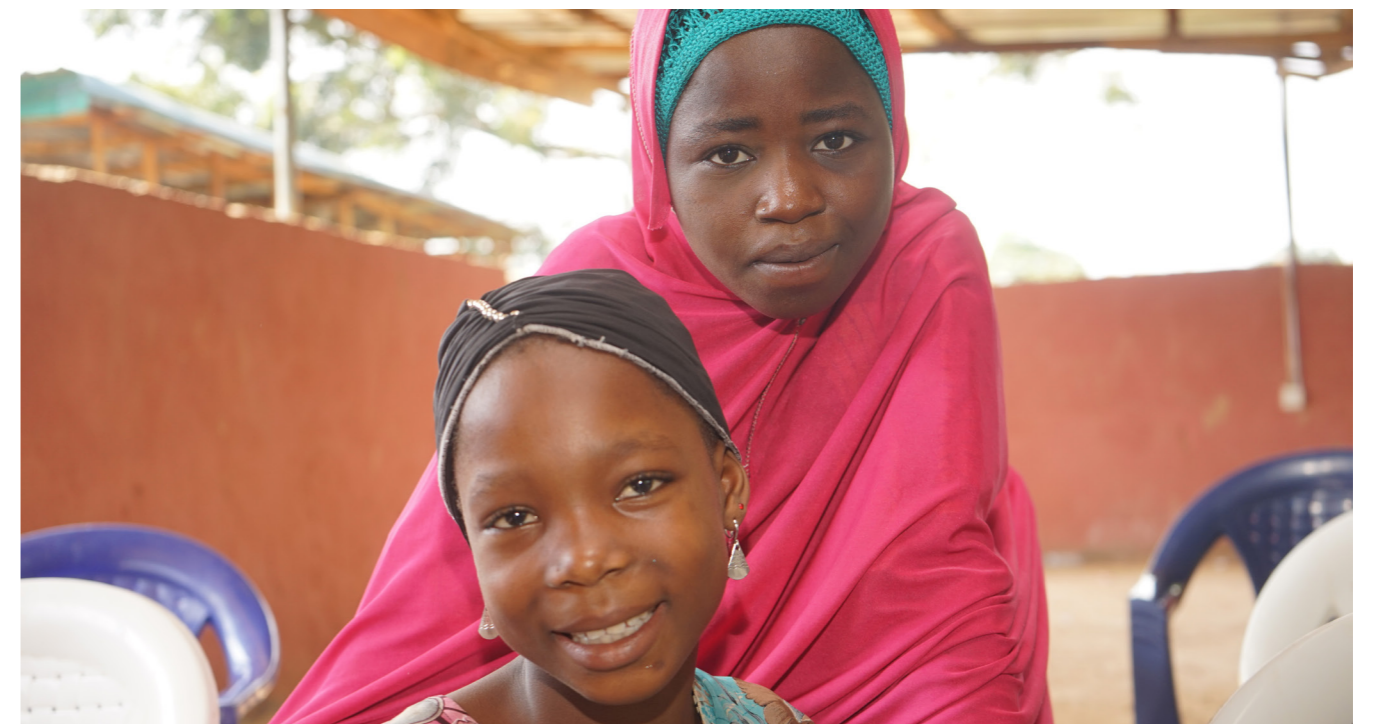
An Empowered Choices project peer session is held in Durumi, an Area 1 IDP camp in Abuja to educate adolescents about STI management.

Country Director, Pathfinder International Nigeria via Radio Nigeria