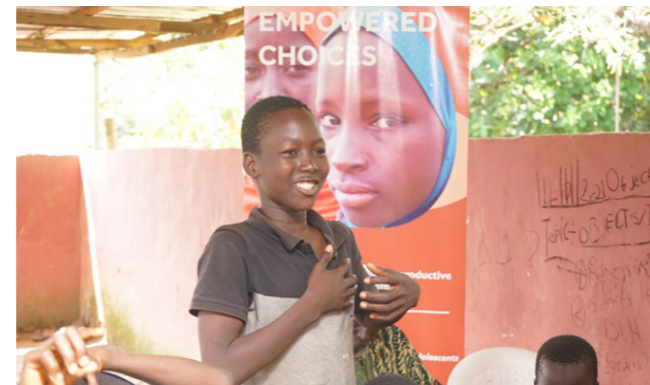
Photo credit: Bayo Ewuola, Pathfinder International, 2022. An Empowered Choices project peer session is held in Durumi, an Area 1 IDP camp in Abuja to educate adolescents about STI management.

These two skills-acquisition sections did not resonate with the adolescent boys, so the project trained them on shoemaking, providing them with both the skills and kits to practice the craft. Liquid soap and shoes are in high demand within the settlement and the nearby community, providing the adolescents with an opportunity to make economic gains in the trade.