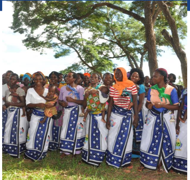
A group of women celebrates during a graduation ceremony at Dzikunze dispensary.

In Mombasa County, AGYW face myriad challenges, including high HIV prevalence rates (9%), poverty, drug abuse, lack of education, idleness, early sexual debut caused by peer pressure and rapid urbanization, risky sexual behavior, limited or no parental guidance, and inability to negotiate for safe sex. These factors adversely affect household incomes, savings, investment, and labor productivity, and have increased the number of orphans and child-headed families.