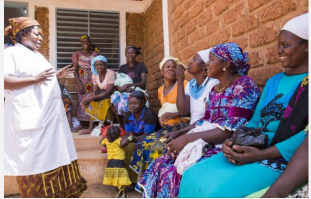
An auxiliary birth attendant talks with women about family planning in Karangasso Sambla, Burkina Faso.

Assists the Ministry of Health in providing quality family planning and reproductive health services, integrated with nutrition services, in Kasai and Kwilu provinces. Uses existing community platforms to deliver services.