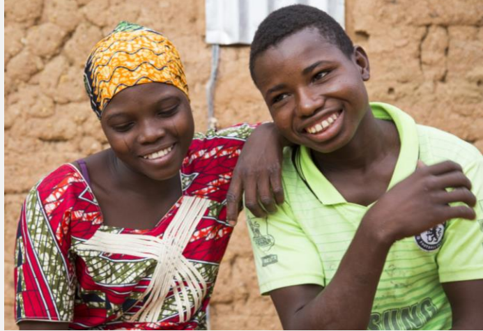
Young couple from the village of Nawaskalé, Niger.

Voluntary access to contraception is central to Pathfinder's work. We work with governments, local organizations, community, traditional and religious leaders to strengthen health systems and the capacity of health workers to deliver contraceptive counseling and a full range of contraceptive methods. Our work with communities shifts norms, beliefs, and behaviors that inhibit women from accessing contraceptive information and services and making autonomous reproductive decisions.