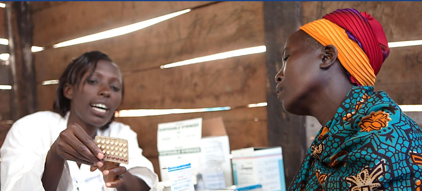
A health worker explains oral contraceptive pills to a client in Muyinga province, Burundi.