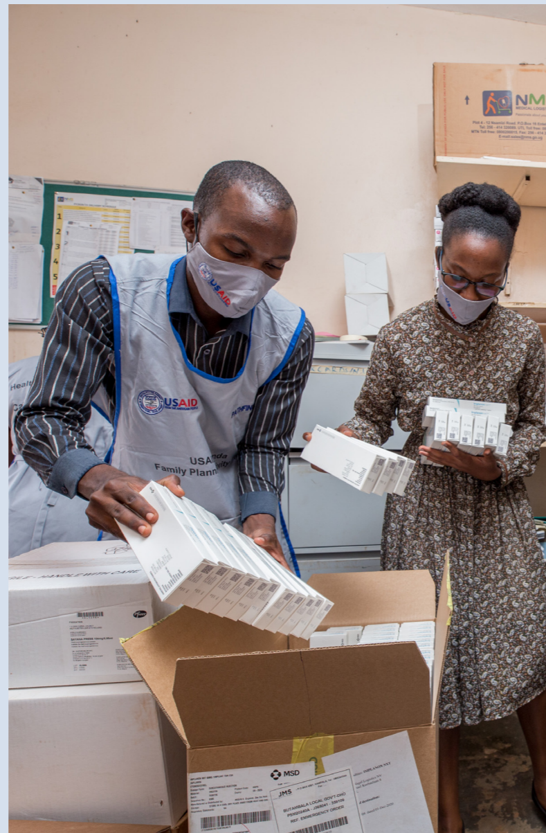
Bulo Health Center, Uganda, November 2021

From 2020-2021, Pathfinder Uganda, through the PAI PHC advocacy grant, advocated for the continuity of maternal and child health services in health facilities during the COVID-19 pandemic. Our advocacy helped to ensure district officers in three districts (Kyegegwa, Kibaale and Gomba) issued mandates and provided oversight to public health facilities as they implemented national guidelines on the provision of maternal and child health services as an essential service during and after the pandemic.