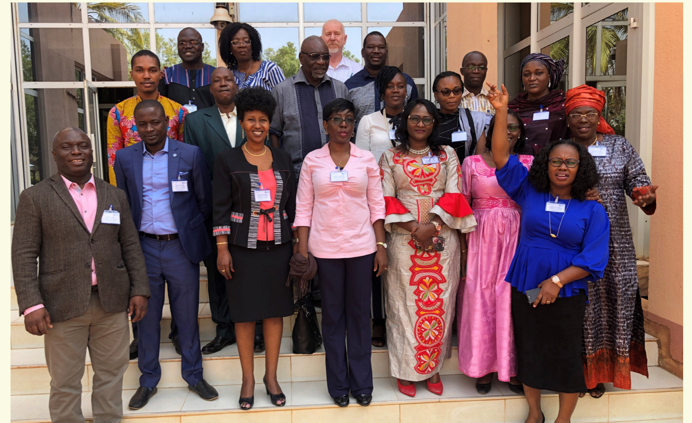
Advocacy workshop in Burkina Faso, where participants learned the Advance Family Planning Smart Advocacy approach.