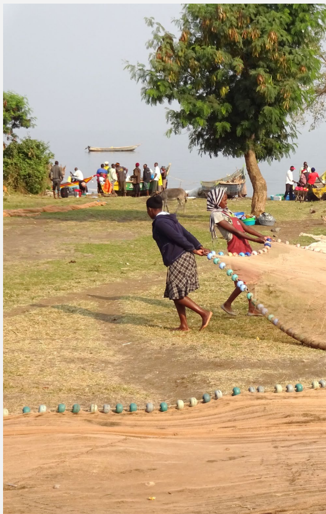
Two women preparing their fishing net on the shore of Lake Victoria, Kenya.