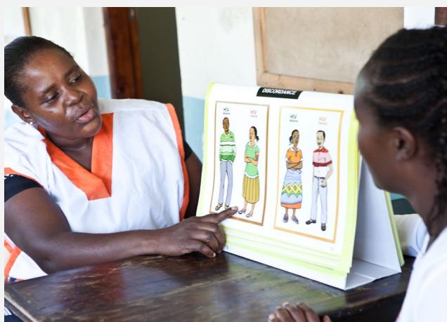
Mentor Mother explaining HIV transmission to a client at Mtwapa Health Center, Kenya.