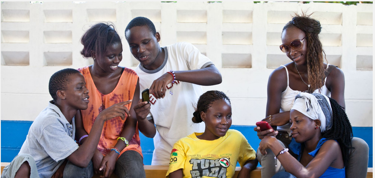
Vipingo Youth Parliament members discussing adolescent and youth sexual health and rights.

Pathfinder is driven by the conviction that all people, regardless of where they live, have the right to decide whether and when to have children, to exist free from fear and stigma, and to lead the lives they choose. Pathfinder builds lasting and trusted local partnerships to strengthen health systems, forging resilient pathways to sexual and reproductive health and rights for all. Taken together, Pathfinder's programs enable millions of people to choose their own paths forward