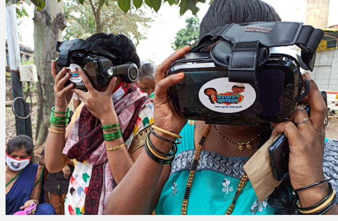
Caption: Participants use virtual reality headsets with Pathfinder's Yuvaa project in India.

Applies a multisectoral approach in partnering with adolescent girls to lay the health, education, economic, and social foundations they need to thrive during the transition to adulthood.