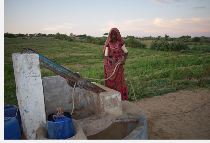
Caption: In Sindh, Pakistan, a woman pulls water from a well.