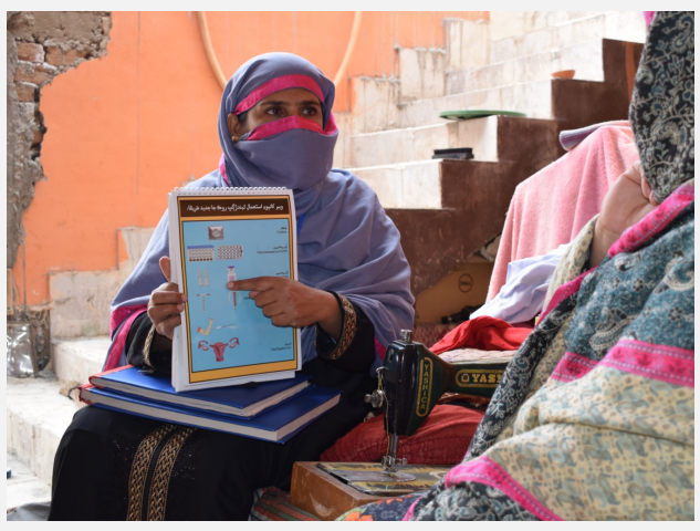
Caption: A Lady Health Worker visits community members.

Supports gender-based and child violence prevention services among refugees and asylum seekers by strengthening servicedelivery systems.