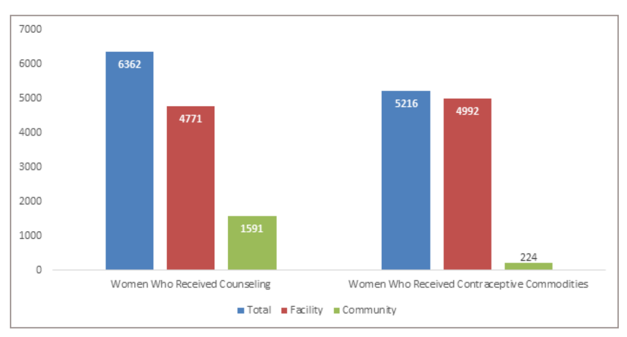
Figure 3. Women of reproductive age who received family planning services by trained CHEWs, by service delivery point