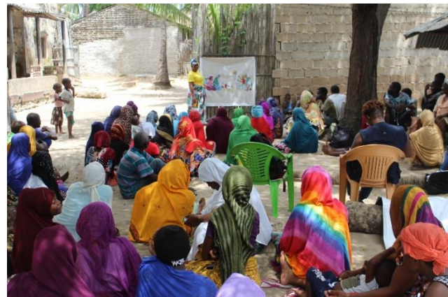
Community debate on early unions in Pemba.

Monitor gender dynamics. It is important to observe changes in the positions, needs, and roles of women, men, boys, and girls during crisis, including transformation or disruption of traditionally gendered spaces, to be able to develop tailored, responsive, gender-transformative interventions. Particular attention should be placed on girls' and women's agency and protection from violence. In fragile settings, we recommend creating women-led safe spaces for girls and women and delivering economic empowerment interventions. Hiring staff with gender expertise and investing in staff training on gender-norm change and social and behavior change—and conducting reflection sessions to