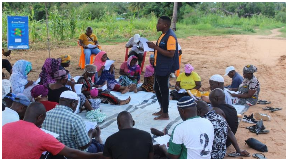
Social Analysis and Action meeting with local leaders and influential community members in Pemba.

Even before the conflict, nearly one-fifth of young women ages 20 to 24 in Cabo Delgado married 7 by age 15, a common coping mechanism employed by families experiencing poverty and influenced by social and gender norms ; 61% married or lived with a partner by age 18. 8 Cabo Delgado has the second highest rate of CEFM and the highest rate of adolescent pregnancy in the country—56.2% of girls ages 15 to 19 are mothers or pregnant. 9 And just as girls are at higher risk of being abducted and raped or forced into marriage in conflict settings, boys are at higher risk of forceful recruitment as soldiers, particularly with the closure and destruction of many schools and the economic strains placed on families who have lost access to their livelihoods. In 2019, Mozambique passed a national law criminalizing CEFM, but the law is not well known or enforced. Reducing CEFM will enhance girls’ freedom and opportunities, keep them connected to and supported by their families and peers, and break cycles of poverty, all of which can help counter violent extremism (CVE)—the use of violence to achieve ideological, political, or religious aims.