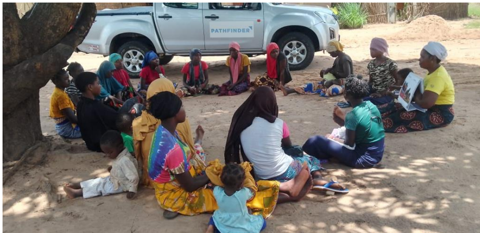
Young women's small group in Marrocane resettlement camp (Ancuabe).

Gender norms. While the internal displacement in Cabo Delgado led to shifting gender roles and relations among families as they adapted to life in the camps, these shifts did not necessarily improve gender equity. Many men lost access to their livelihoods. Unable to fulfill their traditional roles as providers, some grew depressed and turned to alcohol and violence. Unable to work, as men spent more time at home, they assisted with tasks traditionally assigned to women. While this may have alleviated women's burden of labor, it also diminished women's power, as men asserted more control over household decisions that previously fell to women. Male dominance was often reinforced as men took over decisions on the management of the humanitarian aid received.