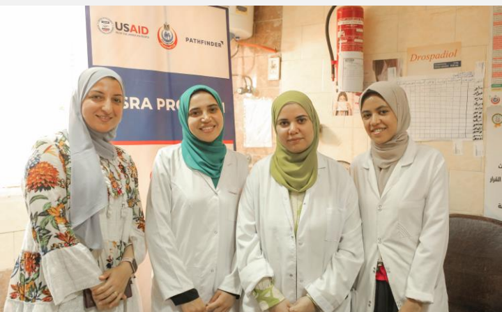
Clinical supervision visit at an OSRA-supported health facility in Egypt.

Projet Yam Yankré (2020–2025) strengthened Burkina Faso's health system by expanding access to contraception and safe abortion services across five regions. Pathfinder provided technical leadership and support to the Ministry of Health's $48 million program. Building on previous investments, the project trained, mentored, and networked providers via their district management teams, while rehabilitating and equipping facilities to improve service delivery. The project also strengthened public sector provision of safe abortion and FP services, positioning Burkina Faso as a leader in advancing universal health coverage for sexual and reproductive health in West Africa.