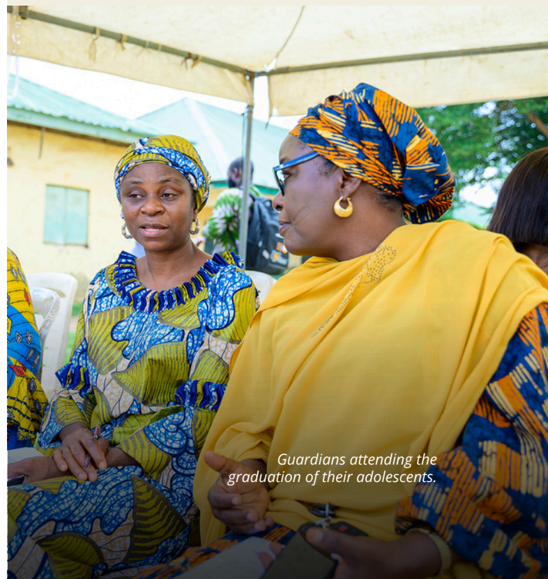
Guardians attending the graduation of their adolescents.

Funded by Organon and implemented in partnership with the Federal Capital Territory Primary Healthcare Board, the Empowering Futures project aims to promote and enhance reproductive health outcomes of adolescents and young people by equipping them with essential life skills through peer mentorship and community-driven approaches.