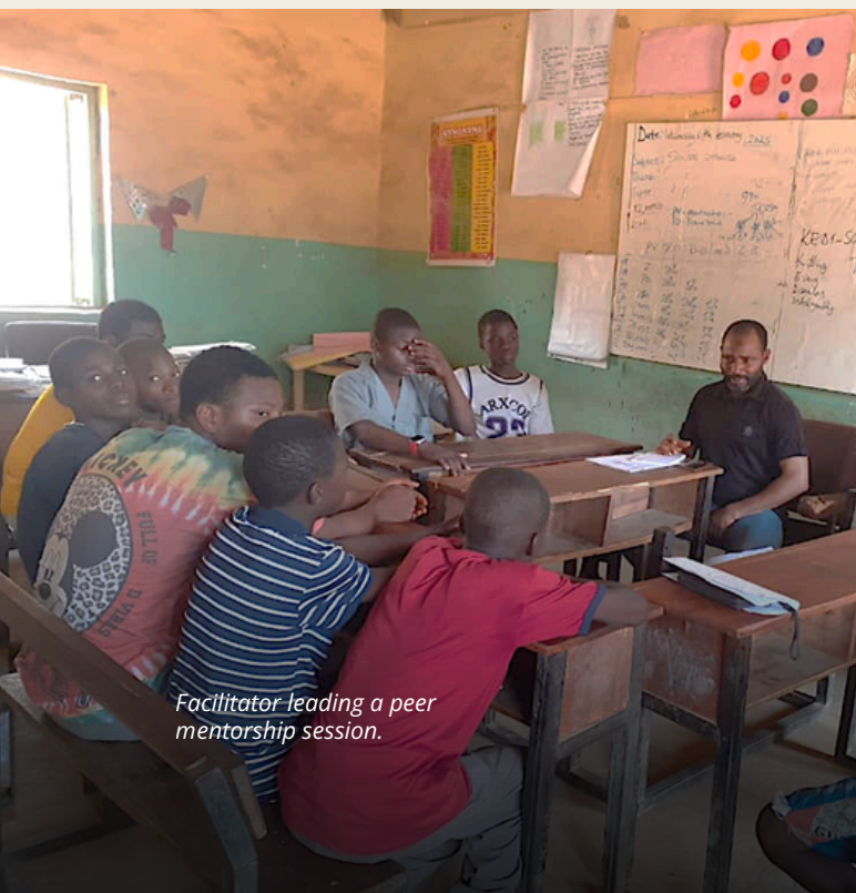
Facilitator leading a peer mentorship session.

One participant, a 13-year-old girl, presented a plan for starting a popcorn business. She explained how she collaborated with her aunt to make and sell popcorn. While her aunt handled production, she handled sales and received a commission. She also shared that she was learning the production process herself so that she could one day independently run her business.